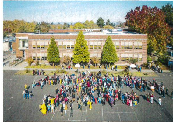
Dia de los Muertos, Harvest Festival Music and Halloween Parade